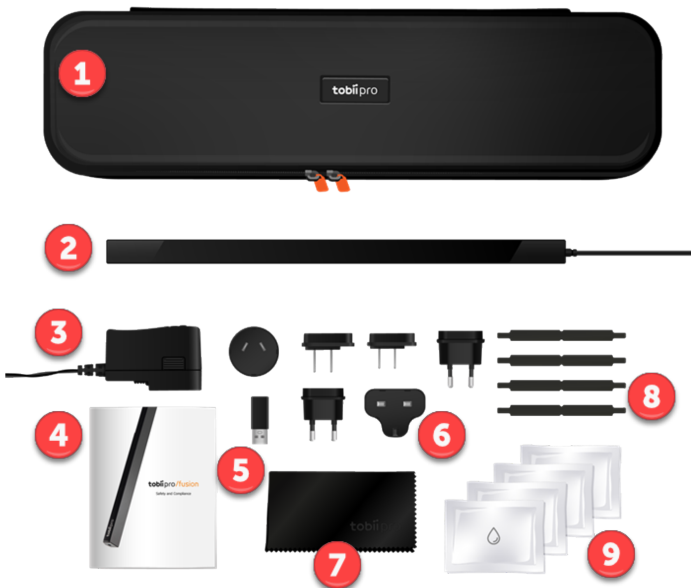
Figure 2. What's in the Pro Fusion box